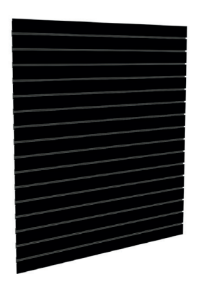
SLATWALL WITHOUT ALUMINUM INSERTIONS